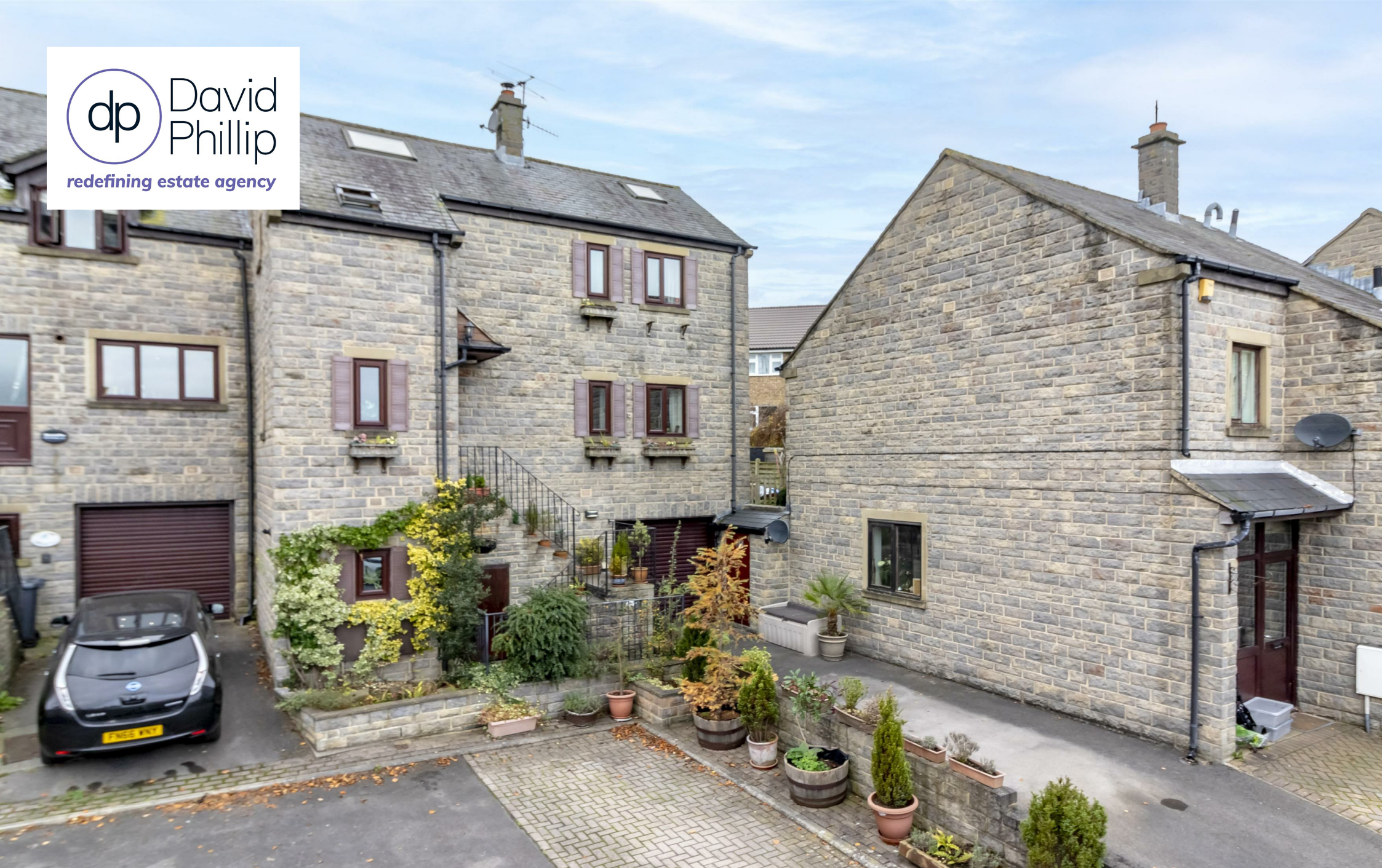
Plum Tree Cottage, 4 The Old Orchard, Pool In Wharfedale, LS21 1RY